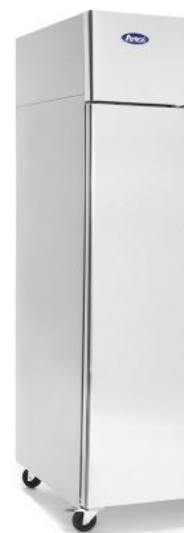
MBF8002 Top Mount (1) One Door Refrigerator