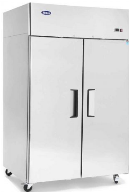
MBF8005 Top Mount (2) Two Door Refrigerator