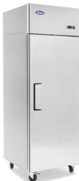
MBF8001 Top Mount (1) One Door Freezer