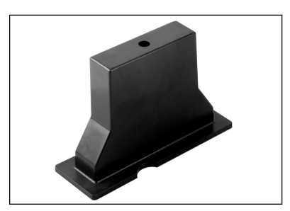
FOOD TRAY SUPPORT