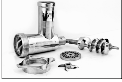
MEAT GRINDER ATTACHMENTS